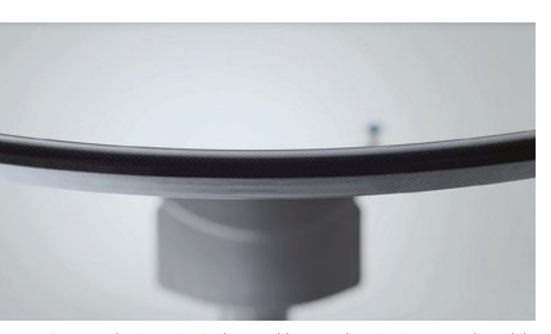
0.4 mm Aluminum Equivalency table top enhancing image quality while reducing radiation exposure for the patient and the entire surgical team.